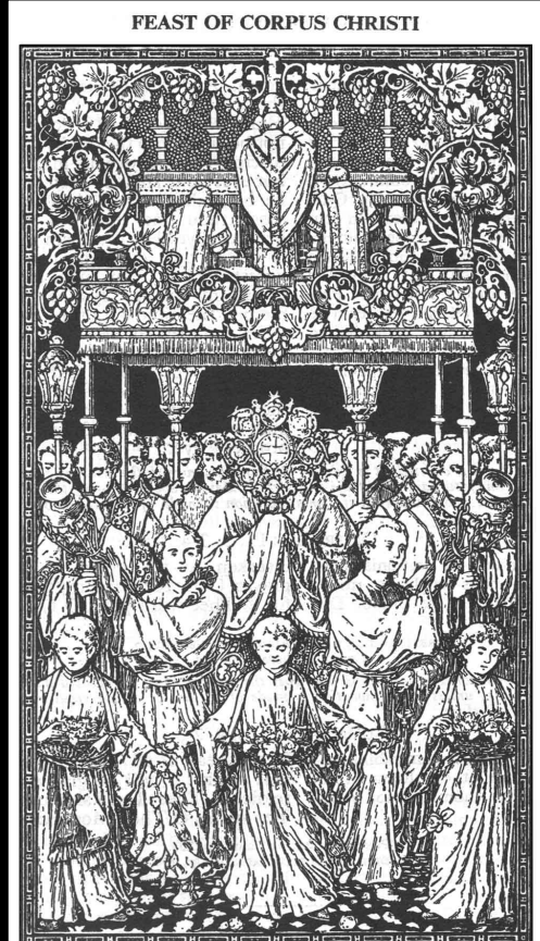
The Most Holy Sacrament