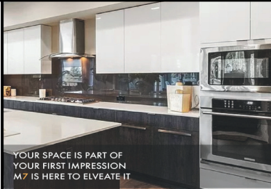
YOUR SPACE IS PART OF YOUR FIRST IMPRESSION M7 IS HERE TO ELVEATE IT