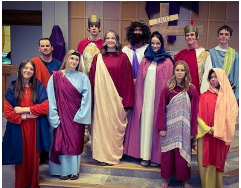
Stations of the Cross with Youth Group from both parishes.