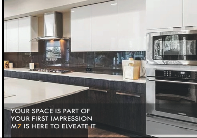
YOUR SPACE IS PART OF YOUR FIRST IMPRESSION M7 IS HERE TO ELVEATE IT