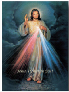
Divine Mercy Celebration The Sunday after Easter April 12, 2026